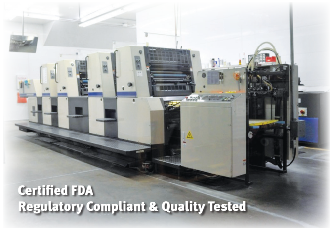
Certified FDA Regulatory Compliant & Quality Tested

Before production begins, the art file is put through a process called 'preflighting', where all parts are reviewed, from document construction to font and graphic usage. The purpose is to alert our customer to potential problems before they result in project delays or cost increases.